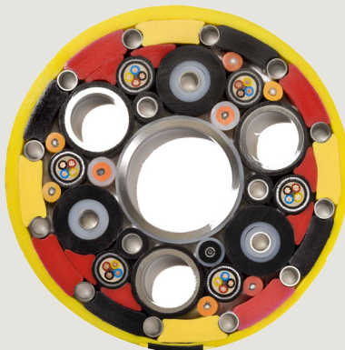
Large Bore Centre Tube