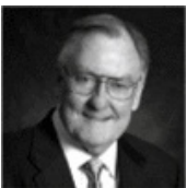
James R. Thompson Principal Occupation: Senior Chairman and Partner of the Law Firm of Winston & Strawn LLP, Chicago, Illinois Age: 72 Director Since: 2001. Governor Thompson will retire at our Annual Meeting of Stockholders in May 2009